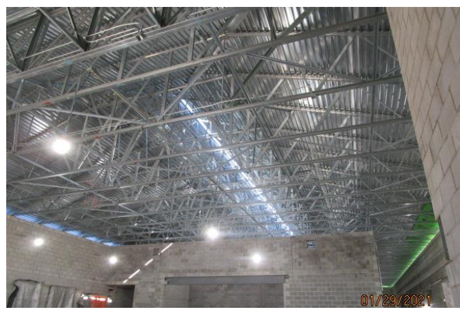
Sandusky Early Learning Academy Grades PK-K – Former Hancock Site – Opening 2022